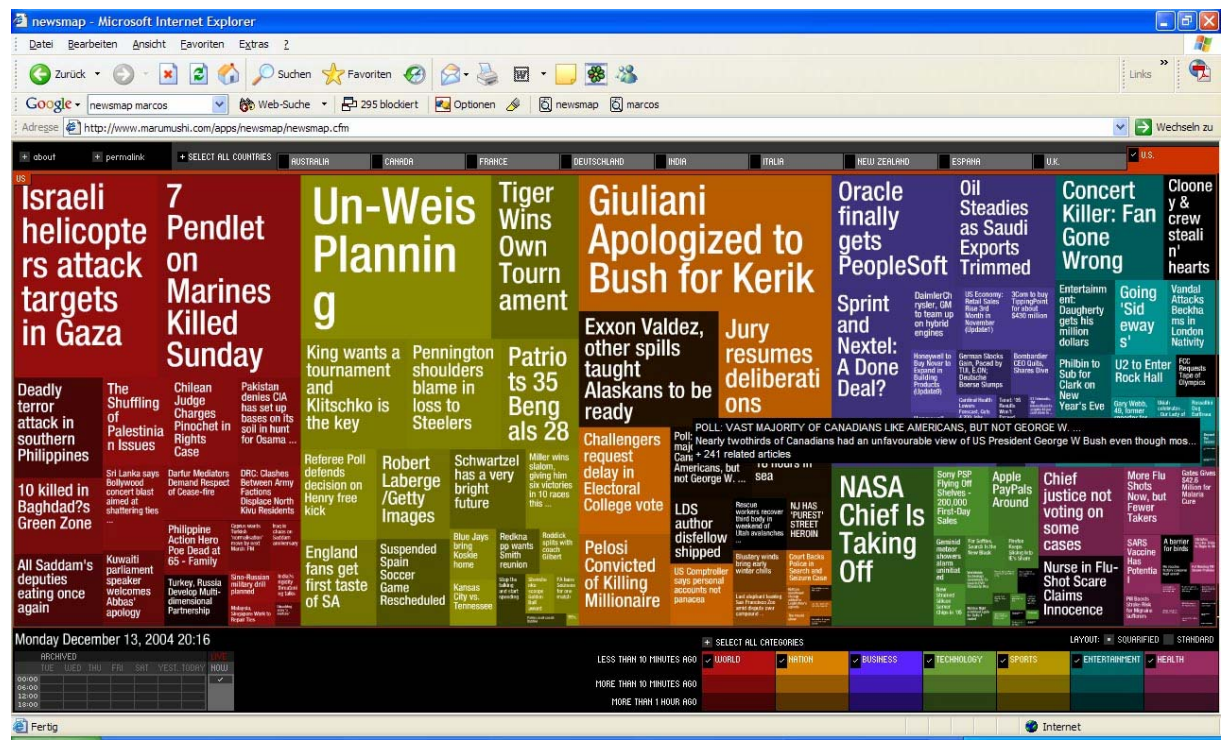
Fig. 4: Marcos Weskamp, "Newsmap" (http://www.marumushi.com/apps/newsmap/)

Marcos Weskamp's "Newsmap" software creates a visual mixture of various topical news headlines. It is a dynamic Web artwork that is based on the combination of decontextualized pieces of information from the Web. It comments on phenomena such as "lost in cyberspace", information overload, and the manipulative usage of decontextualized information by the mass media.