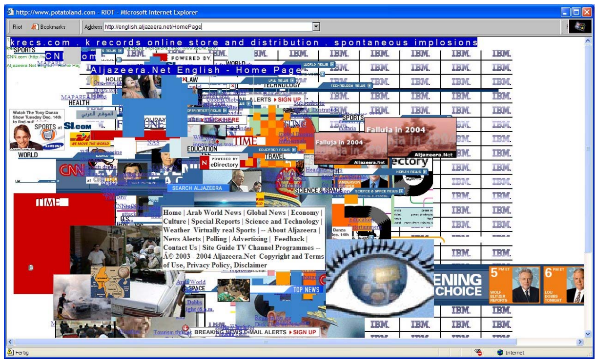
Fig. 2: Mark Napier, "Riot" (http://potatoland.org/riot)

Mark Napier's "Riot" is a Web artwork that combines interactivity, Web browsing functions, and the decontextualization of information characteristic for the Internet. It works like a normal Web browser software, the user can enter URLs. However, the software displays a mixture of elements taken from the history of visited webpages. Hence it builds on decontextualization and the disruption of territorial boundaries. The artwork's form depends on the user's input and the current state of the webpages, it combines user interaction, decontextualization, and emergent re-embedding of decontextualized pieces of information in order to comment on the power of images and logos and the distributed nature of information in the information society.