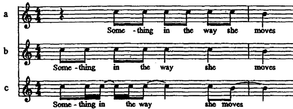
FIGURE 1 George Harrison, "Something," opening lyric compared to two alternate settings..

Figure 1c, is even better. Each of these three notes receives a different kind of accent, and those differences create an overall shape that leads to the word "moves" ("Some-" is a downbeat. "Way" is an anticipated long note. And "moves" is both, which gives it special emphasis). To appreciate the "motion quality" of this overall shape, sing this melody and stop "up in the air" on the word "way." Suspended on the long note "way," we feel a strong anticipation of movement to the next downbeat ("moves"), to complete both the musical and semantic sense of the passage.